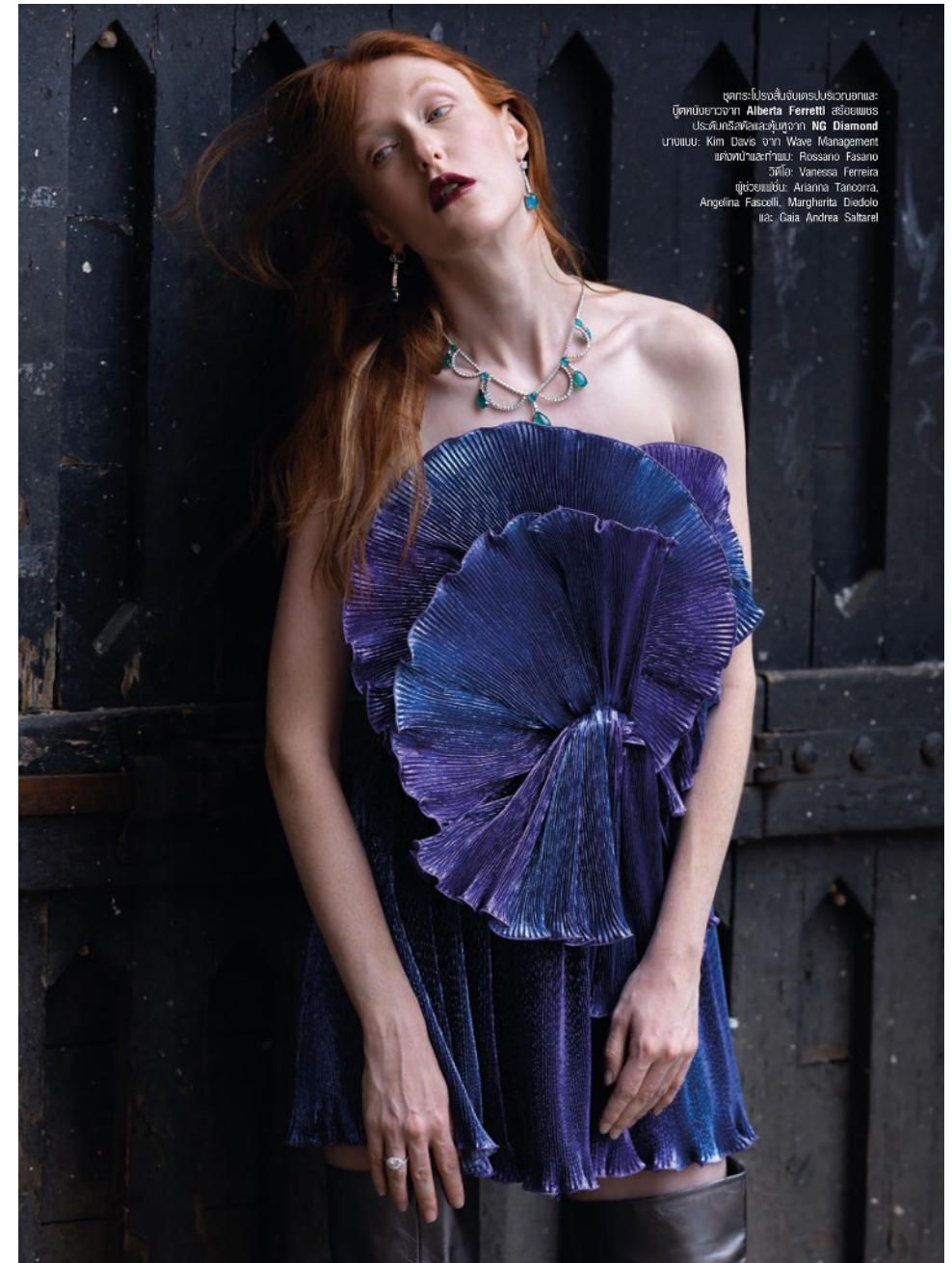
Left and right side Harper's Bazaar Thailand