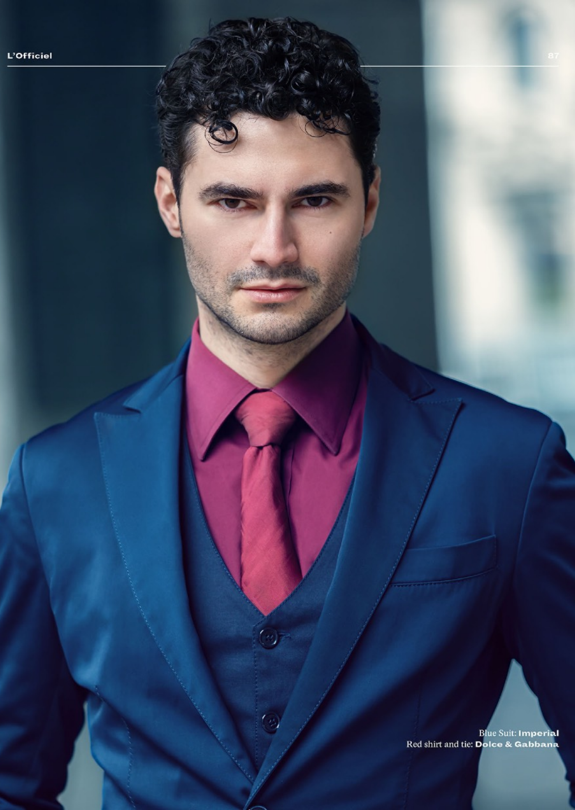
Blue Suit: Imperial Red shirt and tie: Dolce & Gabbana