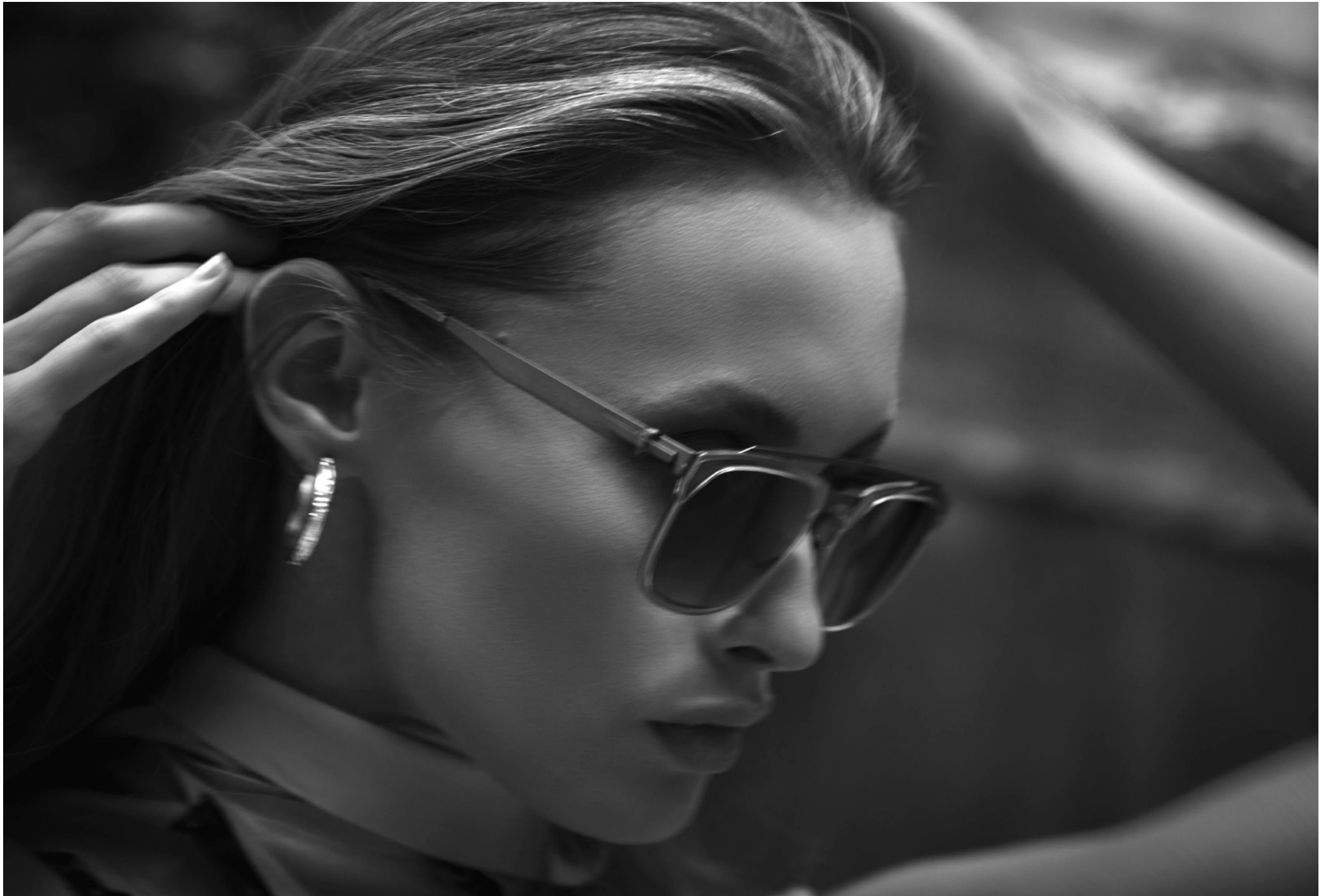
Social campaign Ovvo Optic