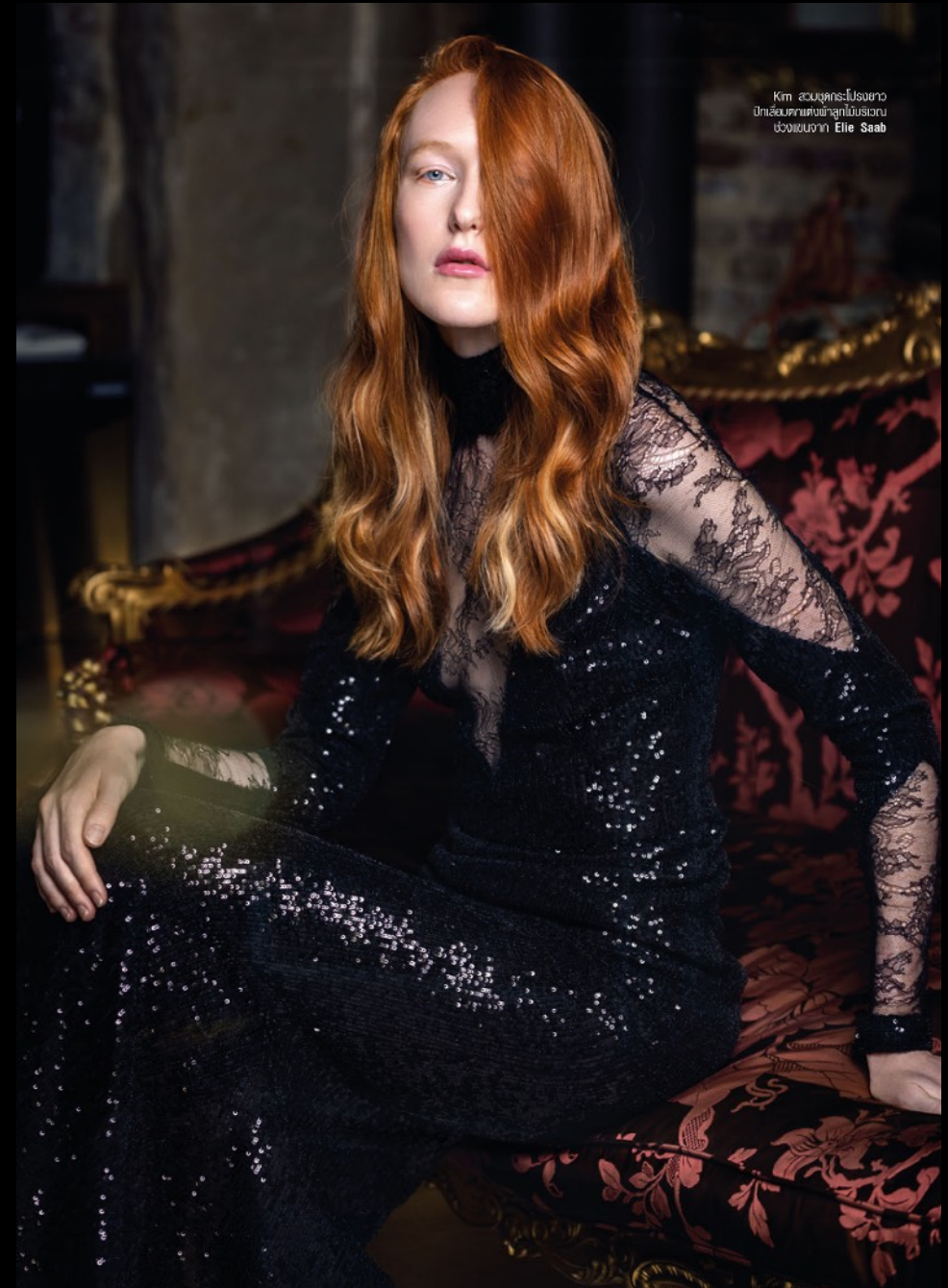
Left and right side Harper's Bazaar Thailand